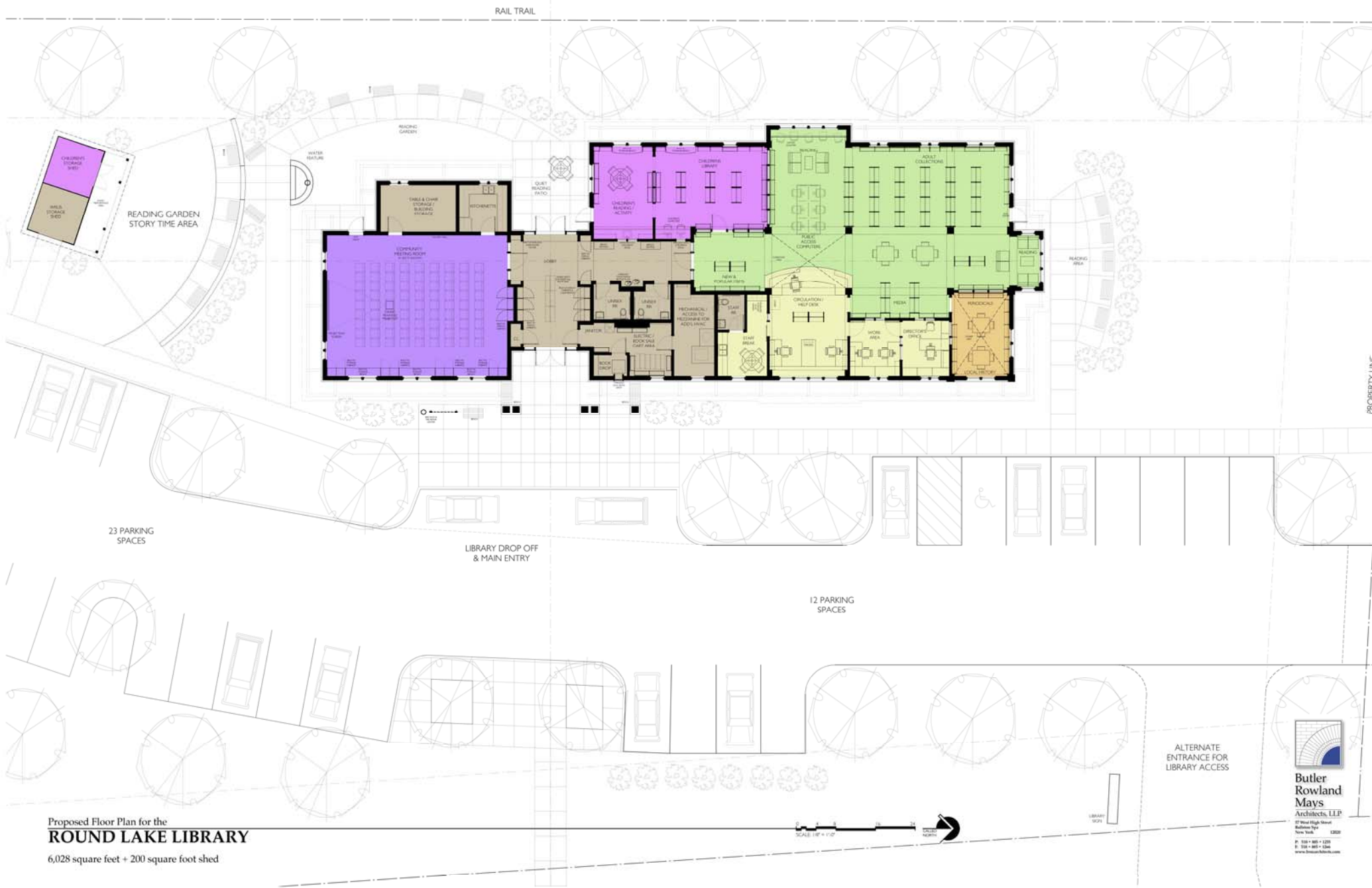
Proposed Floor Plan for the ROUND LAKE LIBRARY 6,028 square feet + 200 square foot shed